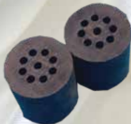
For 9 pcs of cables with diameter 3mm, 2 x 3.1mm