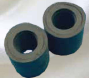
For 1 pc of cable with diameter 17.5mm