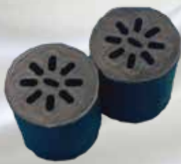
For 9 pcs of drop cables with diameter 2 x 5mm,